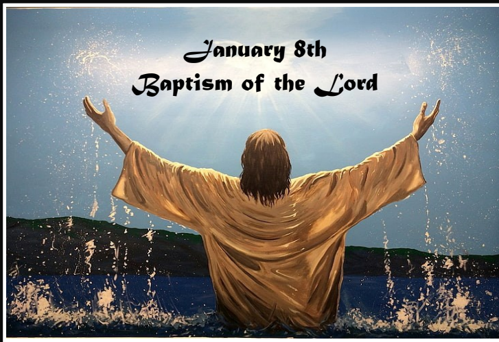
January 8th Baptism of the Lord

St. Martin de Porres Credit Union Located in Purcell Hall 4300 W. Washington Blvd. - 773-626-0776 Open Saturdays: 10:30a.m.-1:30p.m.